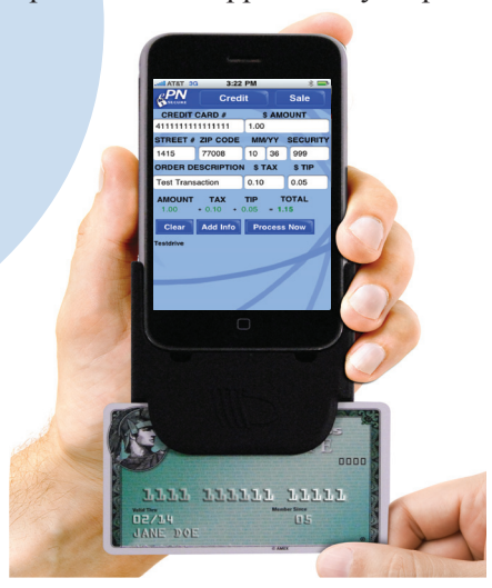
MagTek® iDynamo MagStripe Reader on an iPhone®

The entire process is simple and convenient to use. eProcessingNetwork offers reliable and secure credit card, check and gift card/loyalty transaction processing services and professional support every step of the way.