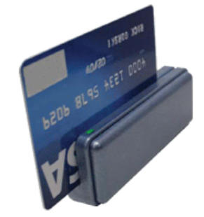
MagTek® Bluetooth-Enabled MagStripe Reader with a BlackBerry® 8800™

The entire process is simple and convenient to use. eProcessingNetwork offers reliable and secure credit card, check and gift card/loyalty transaction processing services and professional support every step of the way.